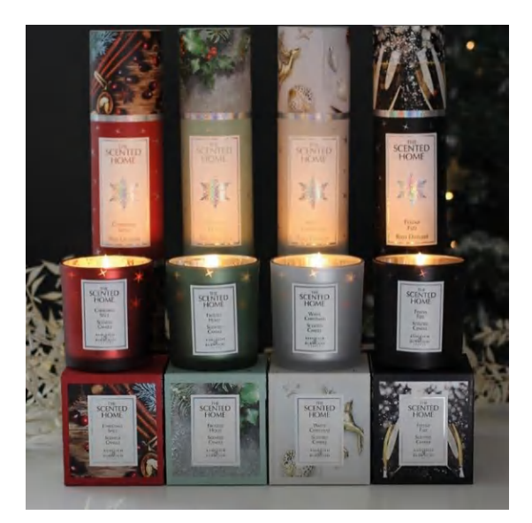
Visit Ashleigh & Burwood on Stand C19

Home fragrance brand Ashleigh & Burwood will be debuting its ever-popular Christmas collections including new 2023 launches at Harrogate Christmas and Gift. Having enjoyed 30 years in business, Ashleigh & Burwood share its passion for fragrance through a product portfolio of diverse scents. Spanning from new wax melts to its unique Fragrance Lamps, Ashleigh & Burwood will help your customers turn their house into a scented home. Ashleigh & Burwood look forward to previewing new Christmas launches, including Scent Sticks to give fragrance to Christmas décor, and introducing you to their point-of-sale merchandising solutions to maximise retailer sales.